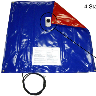
1x 1m heating jacket